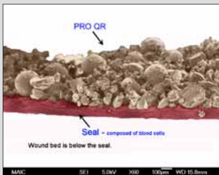
Actual scanning electron microscopy image

When poured on a wound and upon contact with blood or exudate, in combination with manual pressure to the wound, PRO QR Powder quickly forms a strong seal that completely covers the wound and stops the bleeding.